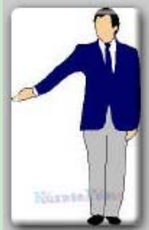
Signal for two points (Wazari)